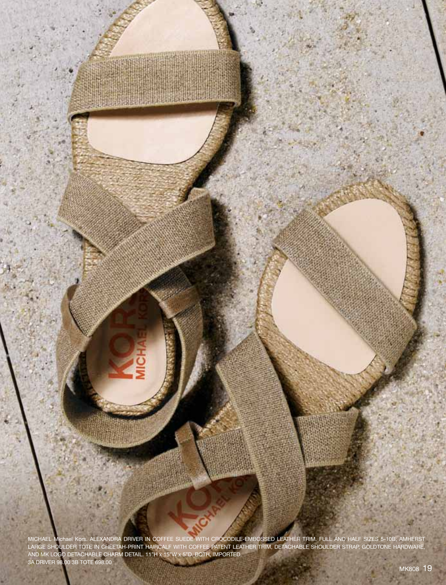
MICHAEL Michael Kors. ALEXANDRA DRIVER IN COFFEE SUEDE WITH CROCODILE-EMBOSSED LEATHER TRIM. FULL AND HALF SIZES 5-10B, AMHERST LARGE SHOULDER TOTE IN CHEETAH-PRINT HAIRCALF WITH COFFEE PATENT LEATHER TRIM, DETACHABLE SHOULDER STRAP, GOLDTONE HARDWARE, AND MK LOGO DETACHABLE CHARM DETAIL. 11"H x 15"W x 5"D. BOTH, IMPORTED. 3A DRIVER 98.00 3B TOTE 698.00