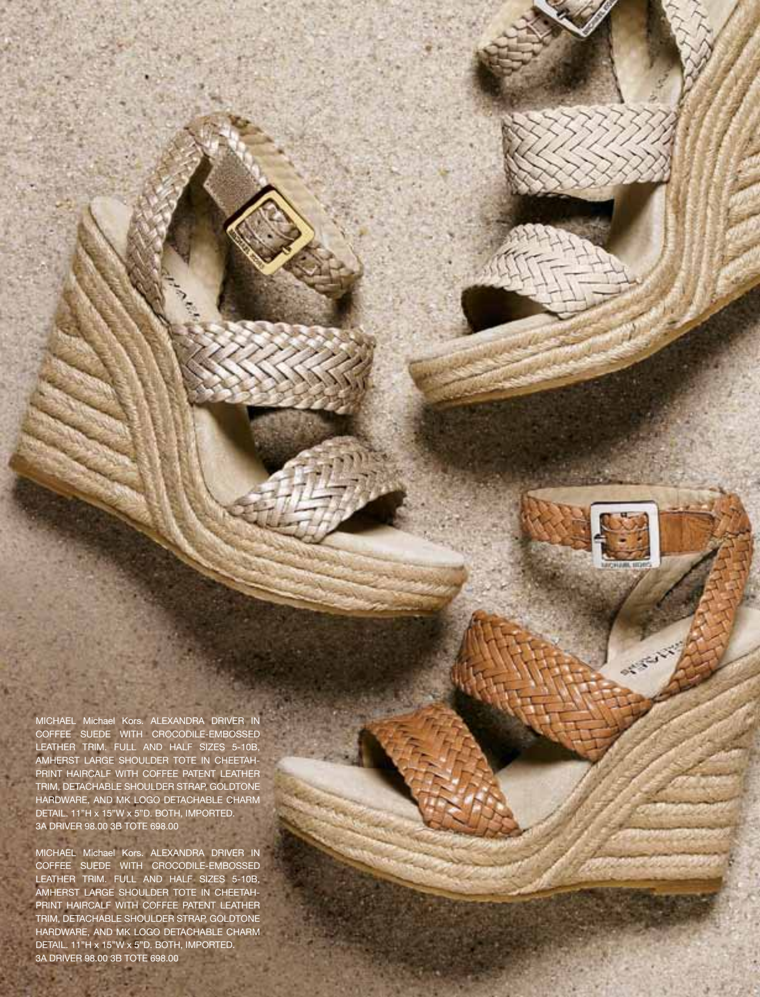
MICHAEL Michael Kors. ALEXANDRA DRIVER IN COFFEE SUEDE WITH CROCODILE-EMBOSSLED LEATHER TRIM. FULL AND HALF SIZES 5-10B, AMHERST LARGE SHOULDER TOTE IN CHEETAH-PRINT HAIRCALF WITH COFFEE PATENT LEATHER TRIM, DETACHABLE SHOULDER STRAP, GOLDTONE HARDWARE, AND MK LOGO DETACHABLE CHARM DETAIL. 11"H x 15"W x 5"D. BOTH, IMPORTED. 3A DRIVER 98.00 3B TOTE 698.00