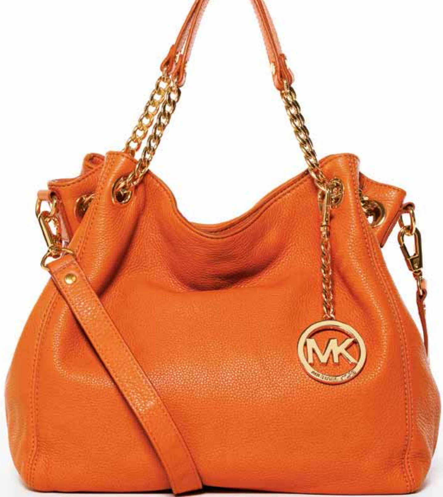
MICHAEL Michael Kors. ALEXANDRA DRIVER IN COFFEE SUEDE WITH CROCODILE-EMBOSSSED LEATHER TRIM. FULL AND HALF SIZES 5-10B, AMHERST LARGE SHOULDER TOTE IN CHEETAH-PRINT HAIRCALF WITH COFFEE PATENT LEATHER TRIM, DETACHABLE SHOULDER STRAP, GOLDTONE HARDWARE, AND MK LOGO DETACHABLE CHARM DETAIL. 11"H x 15"W x 5"D. BOTH, IMPORTED. 3A DRIVER 98.00 3B TOTE 698.00