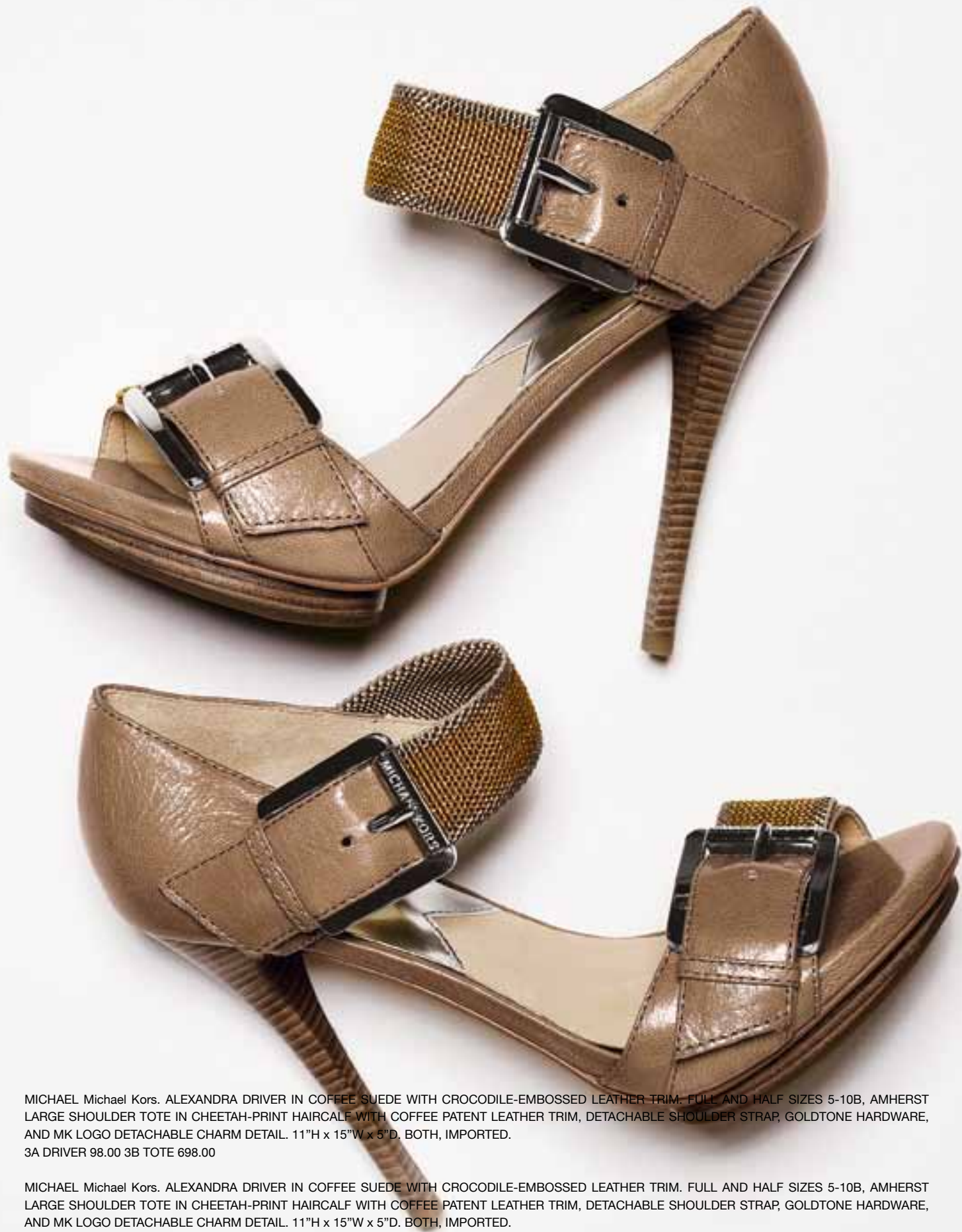
MICHAEL Michael Kors. ALEXANDRA DRIVER IN COFFEE SUEDE WITH CROCODILE-EMBOSSSED LEATHER TRIM. FULL AND HALF SIZES 5-10B, AMHERST LARGE SHOULDER TOTE IN CHEETAH-PRINT HAIRCALF WITH COFFEE PATENT LEATHER TRIM, DETACHABLE SHOULDER STRAP, GOLDTONE HARDWARE, AND MK LOGO DETACHABLE CHARM DETAIL. 11"H x 15"W x 5"D. BOTH, IMPORTED. 3A DRIVER 98.00 3B TOTE 698.00