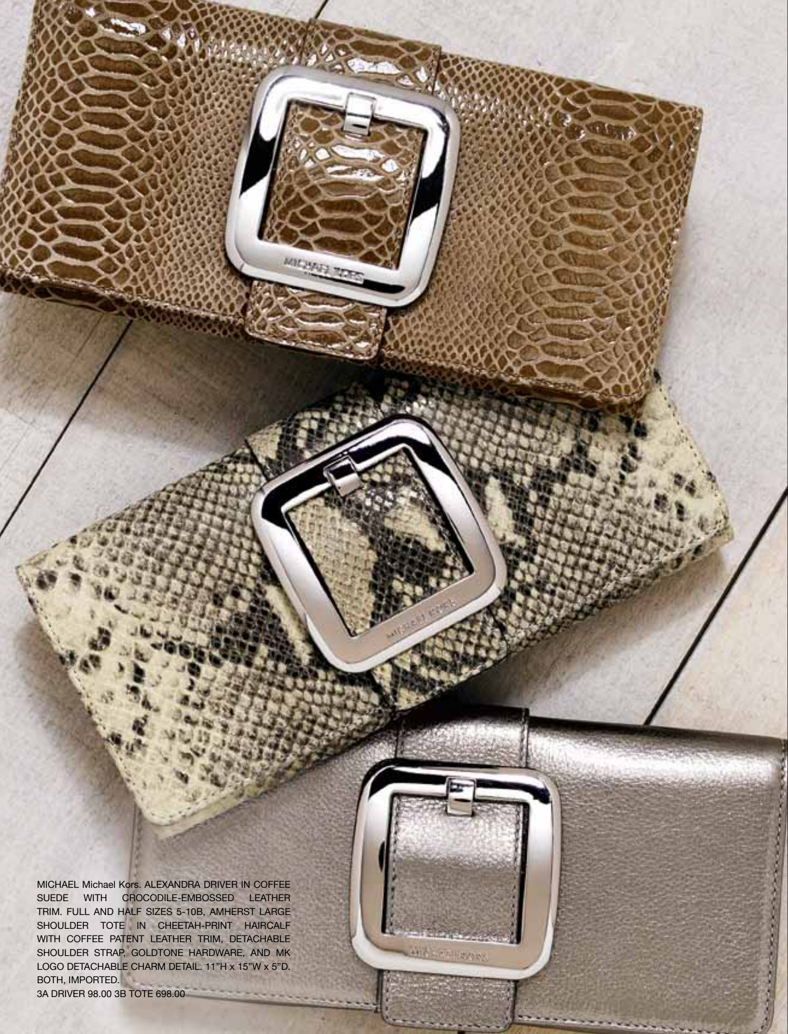
MICHAEL Michael Kors. ALEXANDRA DRIVER IN COFFEE SUEDE WITH CROCODILE-EMBOSSED LEATHER TRIM. FULL AND HALF SIZES 5-10B, AMHERST LARGE SHOULDER TOTE IN CHEETAH-PRINT HAIRCALF WITH COFFEE PATENT LEATHER TRIM, DETACHABLE SHOULDER STRAP, GOLDTONE HARDWARE, AND MK LOGO DETACHABLE CHARM DETAIL. 11"H x 15"W x 5"D. BOTH, IMPORTED. 3A DRIVER 98.00 3B TOTE 698.00