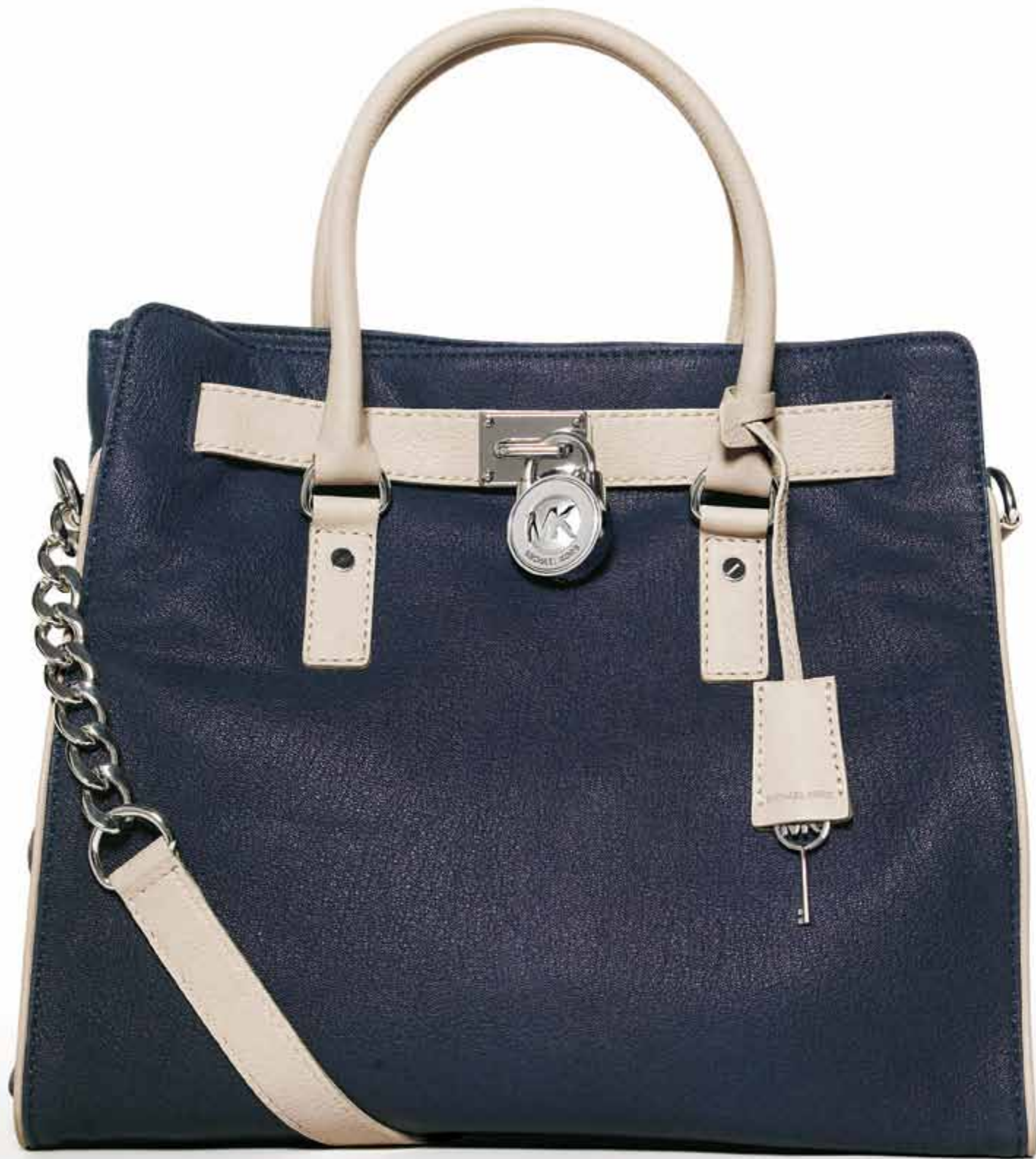
MICHAEL Michael Kors. ALEXANDRA DRIVER IN COFFEE SUEDE WITH CROCODILE-EMBOSSSED LEATHER TRIM. FULL AND HALF SIZES 5-10B, AMHERST LARGE SHOULDER TOTE IN CHEETAH-PRINT HAIRCALF WITH COFFEE PATENT LEATHER TRIM, DETACHABLE SHOULDER STRAP, GOLDTONE HARDWARE, AND MK LOGO DETACHABLE CHARM DETAIL. 11"H x 15"W x 5"D. BOTH, IMPORTED. 3A DRIVER 98.00 3B TOTE 698.00