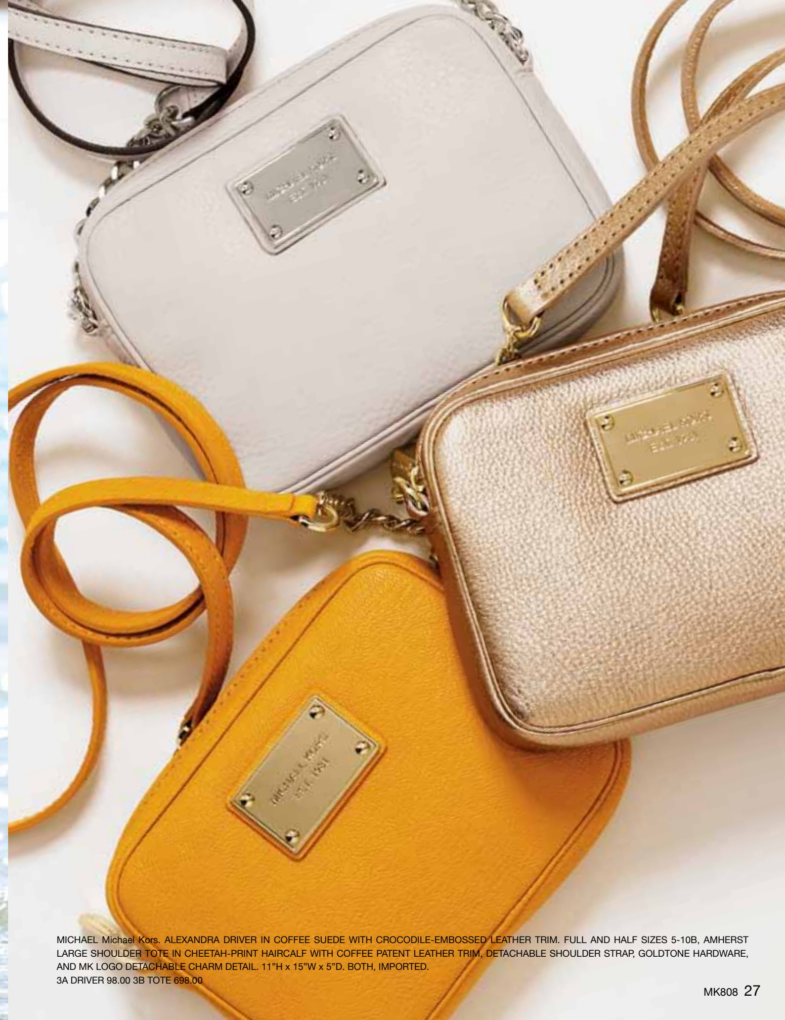
MICHAEL Michael Kors. ALEXANDRA DRIVER IN COFFEE SUEDE WITH CROCODILE-EMBOSSED LEATHER TRIM. FULL AND HALF SIZES 5-10B, AMHERST LARGE SHOULDER TOTE IN CHEETAH-PRINT HAIRCALF WITH COFFEE PATENT LEATHER TRIM, DETACHABLE SHOULDER STRAP, GOLDTONE HARDWARE, AND MK LOGO DETACHABLE CHARM DETAIL. 11"H x 15"W x 5"D. BOTH, IMPORTED. 3A DRIVER 98.00 3B TOTE 698.00