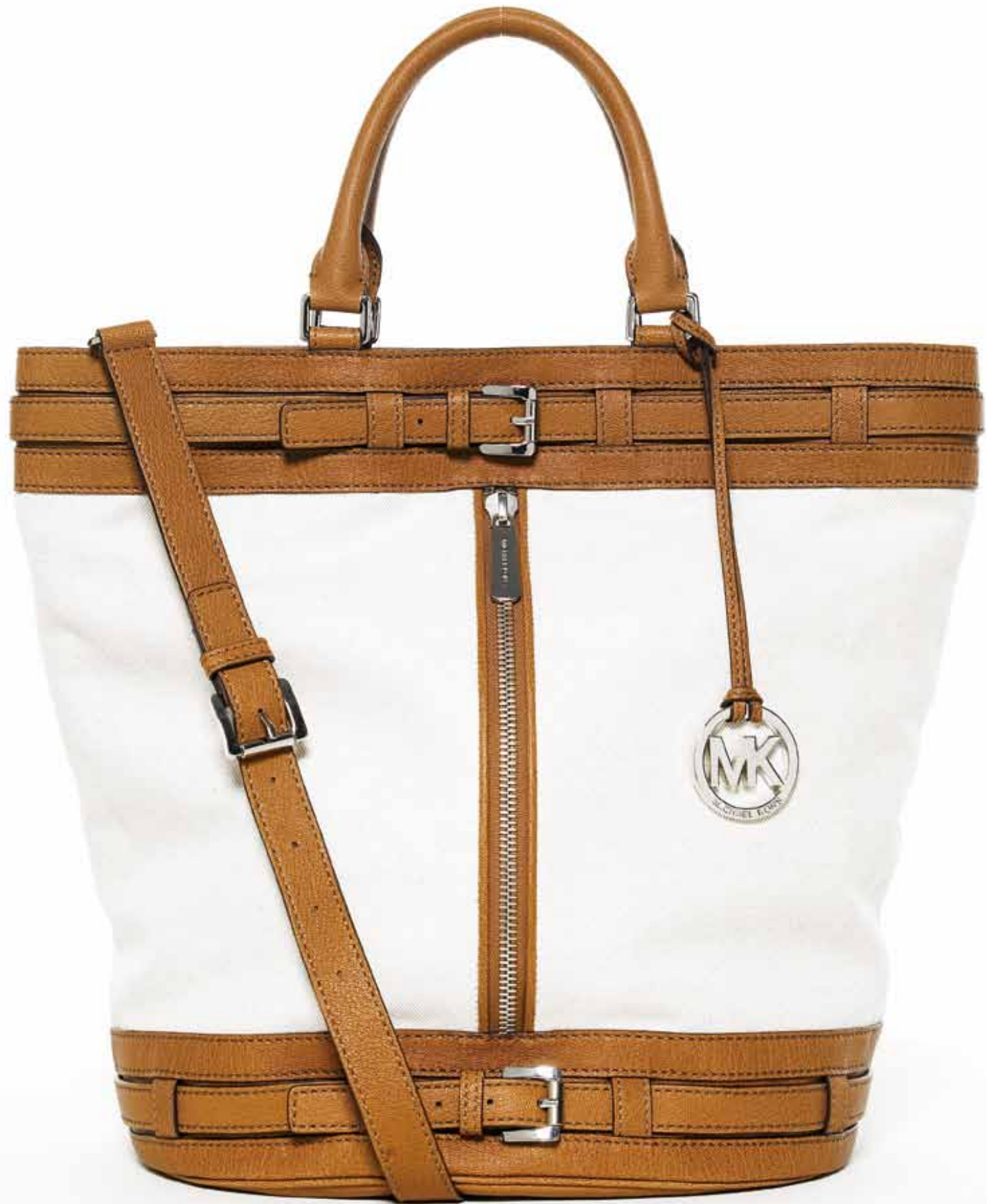
MICHAEL Michael Kors. ALEXANDRA DRIVER IN COFFEE SUEDE WITH CROCODILE-EMBOSSED LEATHER TRIM. FULL AND HALF SIZES 5-10B, AMHERST LARGE SHOULDER TOTE IN CHEETAH-PRINT HAIRCALF WITH COFFEE PATENT LEATHER TRIM, DETACHABLE SHOULDER STRAP, GOLDTONE HARDWARE, AND MK LOGO DETACHABLE CHARM DETAIL. 11"H x 15"W x 5"D. BOTH, IMPORTED. 3A DRIVER 98.00 3B TOTE 698.00