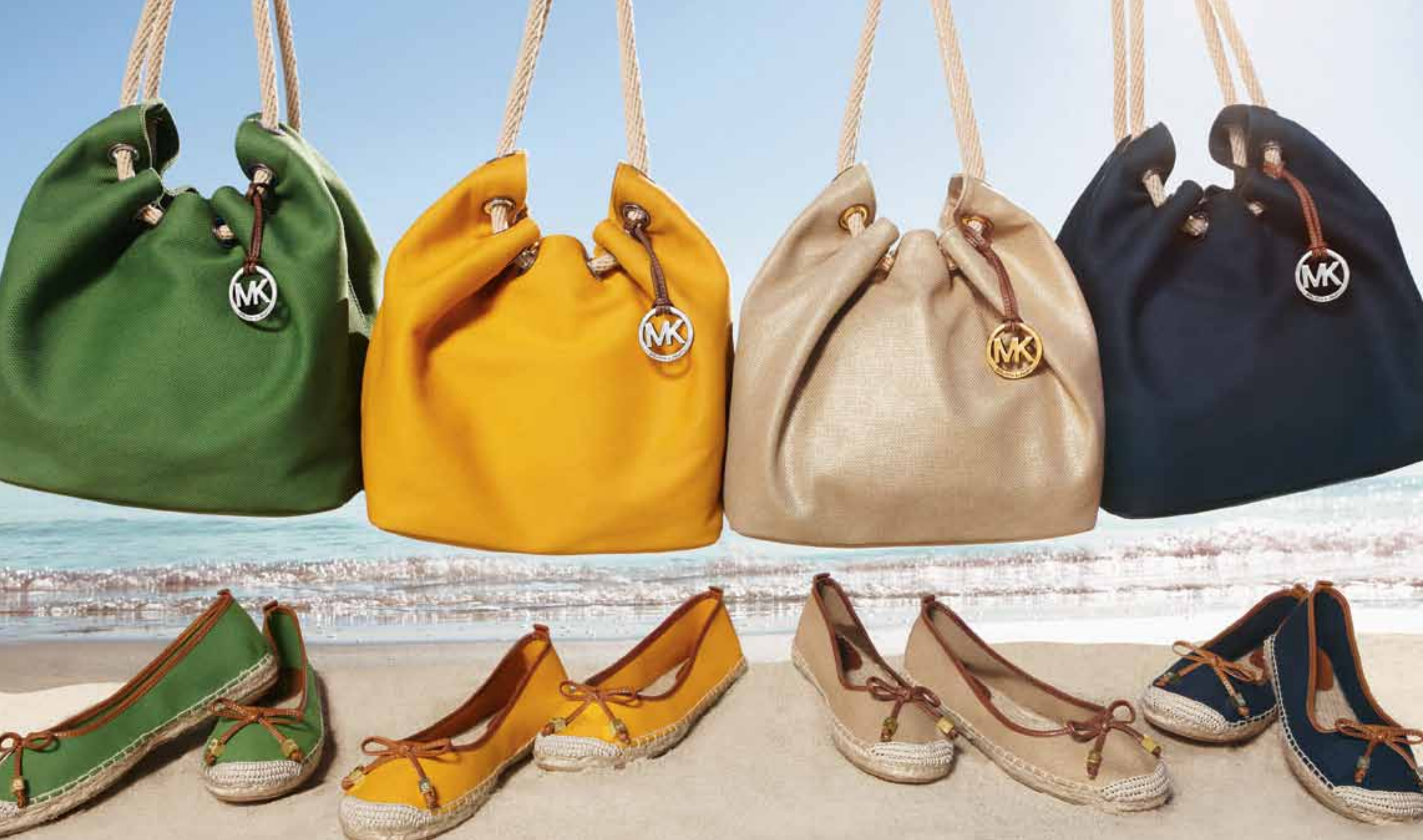
MICHAEL Michael Kors. ALEXANDRA DRIVER IN COFFEE SUEDE WITH CROCODILE-EMBOSSED LEATHER TRIM. FULL AND HALF SIZES 5-10B, AMHERST LARGE SHOULDER TOTE IN CHEETAH-PRINT HAIRCALF WITH COFFEE PATENT LEATHER TRIM, DETACHABLE SHOULDER STRAP, GOLDTONE HARDWARE, AND MK LOGO DETACHABLE CHARM DETAIL. 11"H x 15"W x 5"D. BOTH, IMPORTED. 3A DRIVER 98.00 3B TOTE 698.00